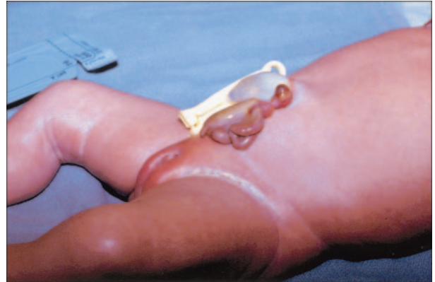
Figure 3. Loss of intestine due to closure of the fascial ring during gestation, resulting in an atresia and loss of most of the mid-gut.

urine output. Acidosis may be present because of hypovolemia. Bolus fluids using 5% albumin may be helpful because most affected infants also suffer hypoproteinemias.