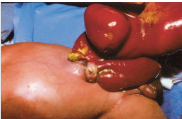
Figure 2. Gastroschisis exhibiting thickened peel on the bowel prior to closure.

toward fluid resuscitation, temperature management, and protection of the bowel. Because the intestine is herniated outside of the abdominal wall, a large quantity of serous fluid may be lost, and the bowel radiates substantial heat, which can lead rapidly to hypothermia. All affected infants must receive prompt, secure intravenous (IV) access through a peripheral IV line and be kept as warm as possible. Infants may need 90 to 200 mL/kg per day of total fluids to establish and maintain adequate