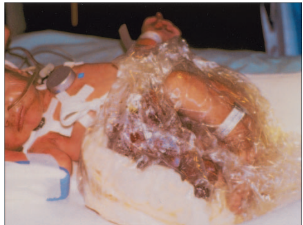
Figure 4. Infant placed in a bowel bag for transport. Note the presence of a nasogastric tube. In this case, gauze is placed in the bag, but this approach requires a nonadherent dressing next to the bowel. The child should be transported with the right side down.

Transport is best accomplished by placing the entire infant, to the level of the axilla, in a plastic bag (a bowel bag usually can be obtained from the operating room and works very well) (Fig. 4). The bag helps retain heat and moisture and protects the bowel. In almost all cases, the abdominal wall defect is to the right of the umbilicus. Therefore, babies should be placed with the right side down to cause as little tension as possible on the mesenteric vessels because they herniate outside of the abdomen. The intestine does not need to be supported on