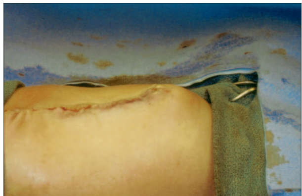
Figure 7. The bowel has been reduced fully, and the child has been returned to the operating room for final fascial closure.

One of the reasons that any type of silo is useful is that the intestine often is edematous. This edema worsens the visceroperitoneal disproportion. Placing the bowel in the silo allows resolution of the edema and gentle reduc-